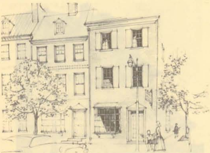
Possible retail store rehabilitation drawn for Mr. Altman